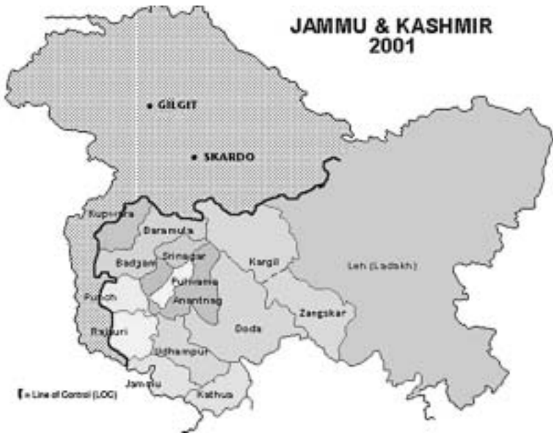
FIGURE 1 THE DISTRICTS OF INDIAN JAMMU AND KASHMIR

This map shows the Line of Control between India and Pakistan, but does not show the eastern portions of Ladakh seized by China in 1962, known as Aksai Chin. Adapted from the Census of India website, 2001