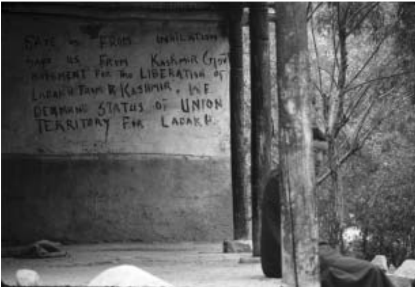
August 1989.

A MONK WAITS FOR A BUS, IN FRONT OF GRAFFITI DISPLAYING ANTI-KASHMIRI SLOGANS DURING THE LADAKHI AUTONOMY MOVEMENT OF 1989