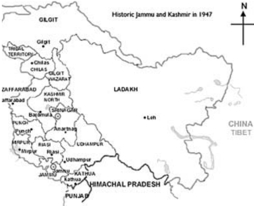
FIGURE 2 JAMMU AND KASHMIR IN 1947, SHOWING THE HISTORIC LADAKH WAZARAT

narratives from partition and more recent communal tensions in Zangskar. As my account draws primarily from Buddhist informants, selected Indian military accounts, and contemporary news sources, it does not claim to be a comprehensive account of Zangskari partition or of the contemporary situation. However, it does offer some perspective on the politics of being Buddhist and being marginal in Jammu and Kashmir today.