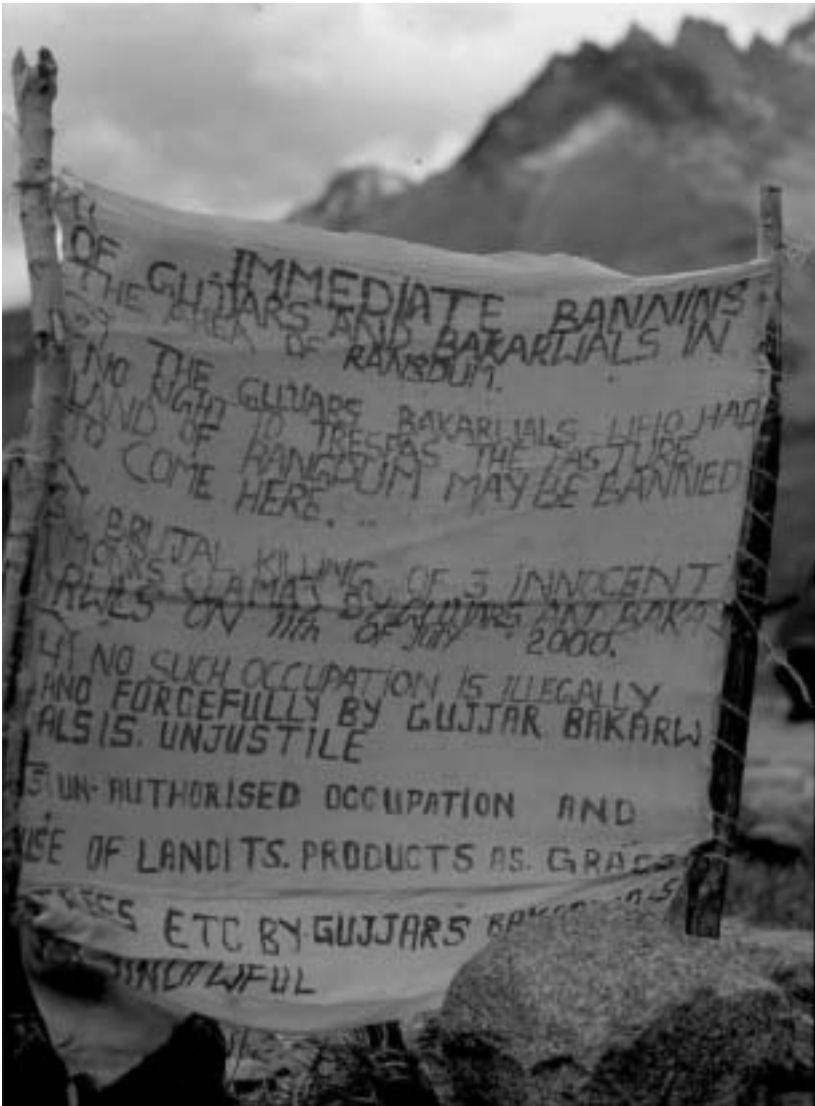
FIGURE 4 RANGDUM MONKS PROTEST SIGN

Rangdum Monks Posted This Sign To Protest The Collusion Of Bakkarwal And Gujjar Nomads In The Brutal Murder Of Three Monks On July 11, 2000. The Monastery's Demands Include Preventing The Nomads From Trespassing Upon The Monastery's Pasture Lands Henceforth. Photo By Kim Gutschow, July 2000.